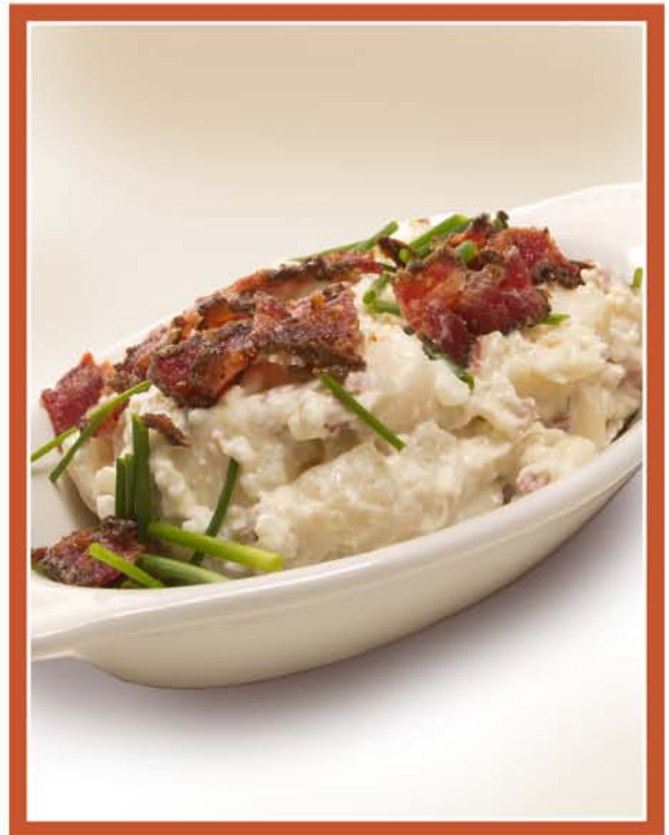
MASHED POTATOES WITH SCHMACON™ BITS & CHIVE