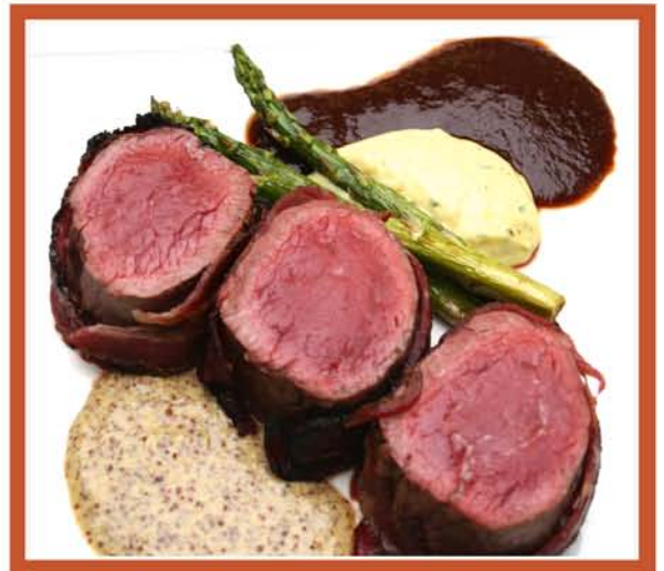
SCHMACON™ WRAPPED TENDERLOIN