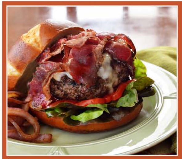
SCHMACON™ & SWISS TOPPED SCHMACON™ BITS STUFFED BURGER