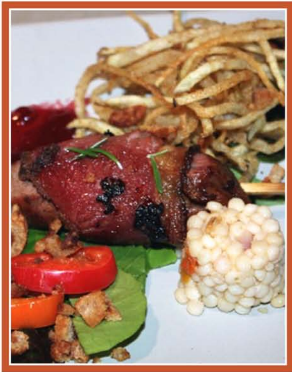
SCHMACON™ WRAPPED DUCK BREAST