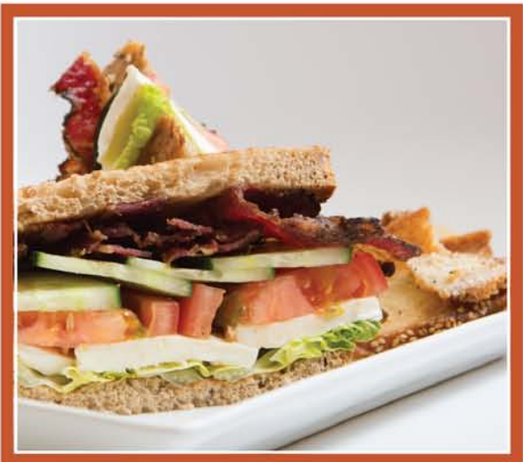
SCHMACON™ CAPRESE CLUB