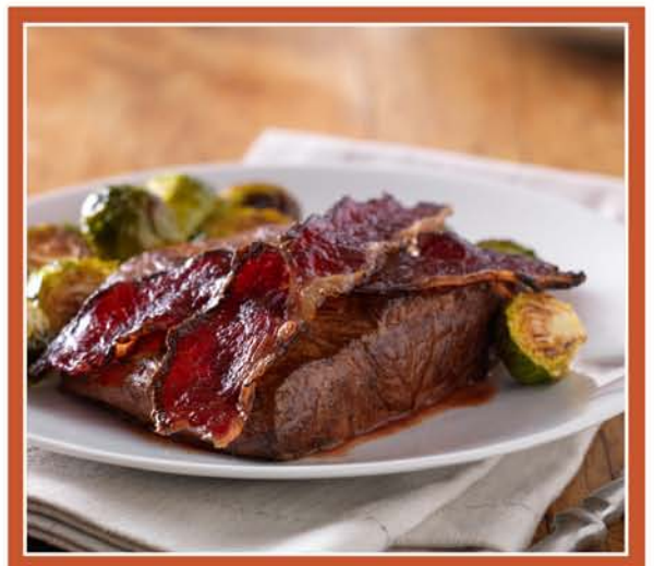
SCHMACON™ N' STEAK